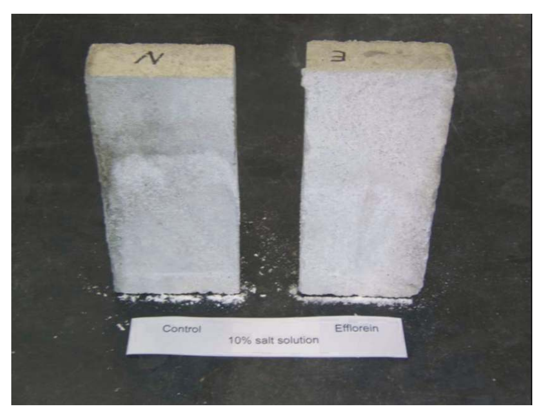
Photo 4: Specimens after 3 days in 10% salt solution, then air-drying

A trial currently under way is examining whether the use of Efflorein offers some improvement in salt attack resistance.