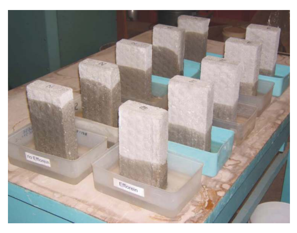
Photo 1: Control and Efflorein specimens after 18 hr in 1% salt solution

Concrete was poured into wooden moulds with plastic sheeting underneath, to make slabs 40 mm thick. The slabs were cured for 2 days, including 5 hr at 35°C, and then cut into 200 x 100 mm specimens for the efflorescence trials.